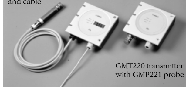
GMT220 transmitter with GMP221 probe